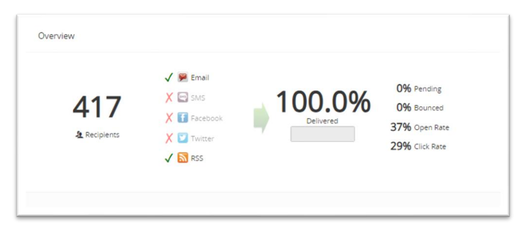
Image 1: Digital analytics demonstrating recipient figures and open rates

58. We are also able to measure what our staff like to read by analysing the unique clicks and this will help us to shape future messaging and communications strategies.